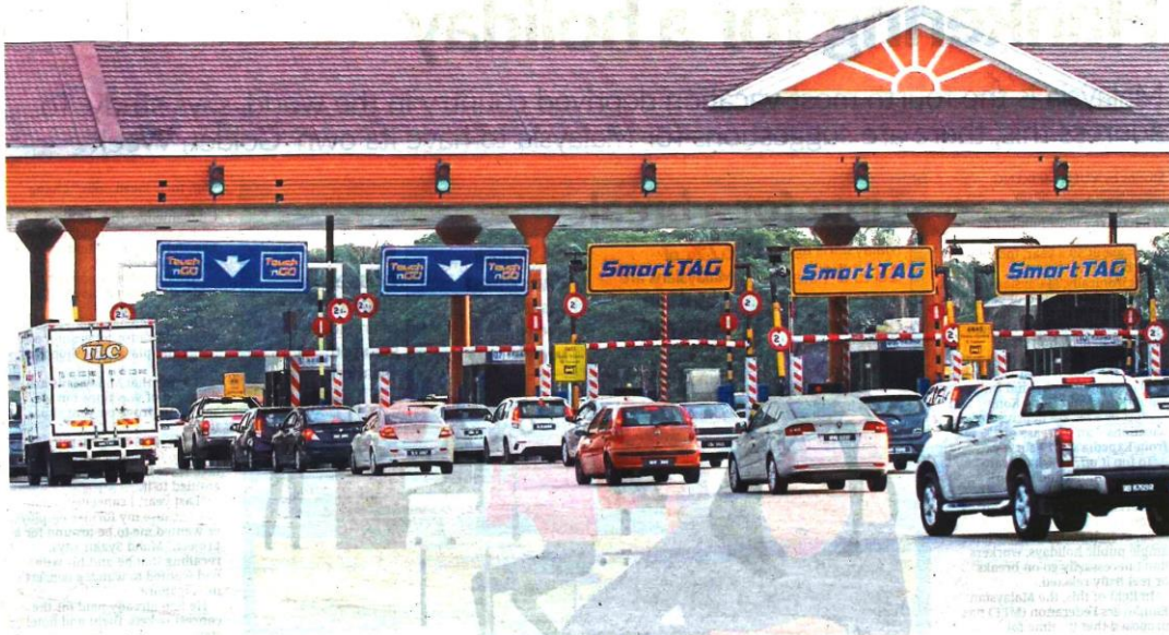
Touch 'n Go has always pioneered the move towards a cashless society as well as built on the urban mobility infrastructure in Malaysia